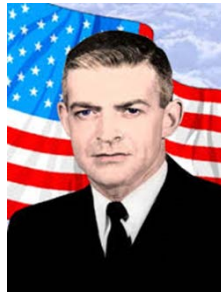
Father Vincent Robert Capodanno, M.M.

MEETING NOTICE NEXT MEETING IS WEDNESDAY February 7th AT 7:00 PM At Our Lady of Mercy Country Home 2115 Maturana Dr. Liberty MO 64068