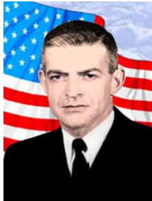
Father Vincent Robert Capodanno, M.M.