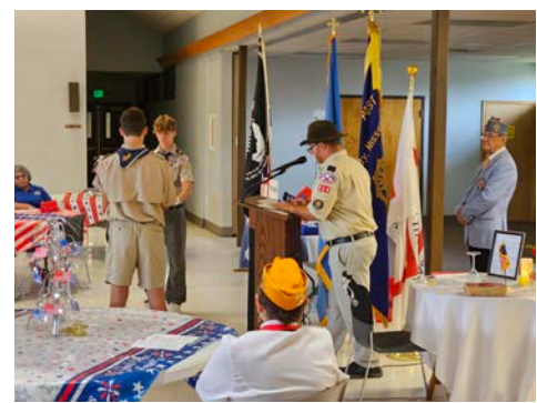
Folding of flag

Our thanks go out to all who helped with the ceremony.